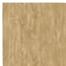
Wood Knotty Pine